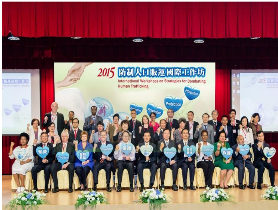
President Ma Ying-Jeou and foreign scholars and experts