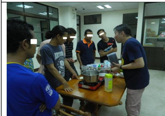
Skill training: provide training courses that meet the needs of the victims so they could be in touch with various topics and find what they are good at through this exploring process.