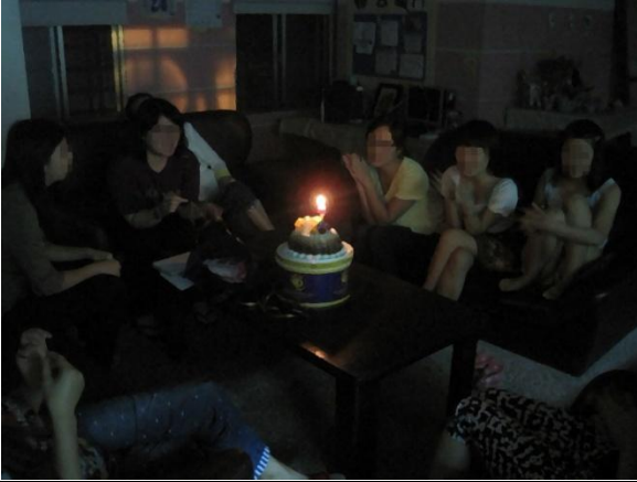
Birthday party: a birthday party for the victim who felt much blessed by others.