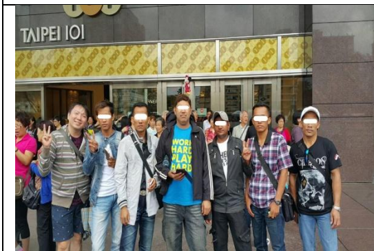
Outing: after a vote, the victims went for a one-day trip to the Taipei 101 and its neighboring area they chose. They could not only see the beauty of Taiwan but got to know each other even better.