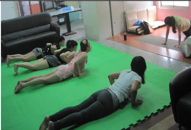
Sovananda yoga: relax body and soul and help find the balance. Relieve the pressure.