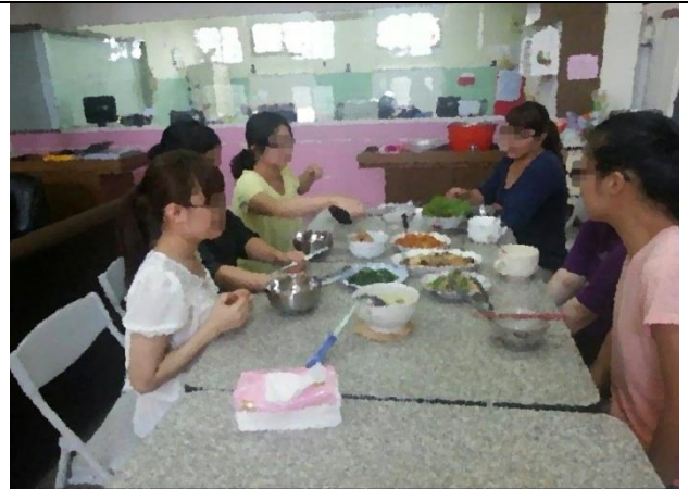
Family day: foster understanding of different cultures by making cuisines of various countries.