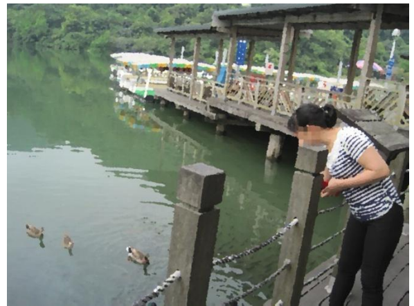
Take a walk to know the place better: walking around not only helps the victims know the surroundings better but lets them feel relaxed and relieved.