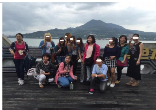
Outing: after a vote, the victims went for a one-day trip to the Taipei 101 and its neighboring area they chose. They could not only see the beauty of Taiwan but got to know each other even better.