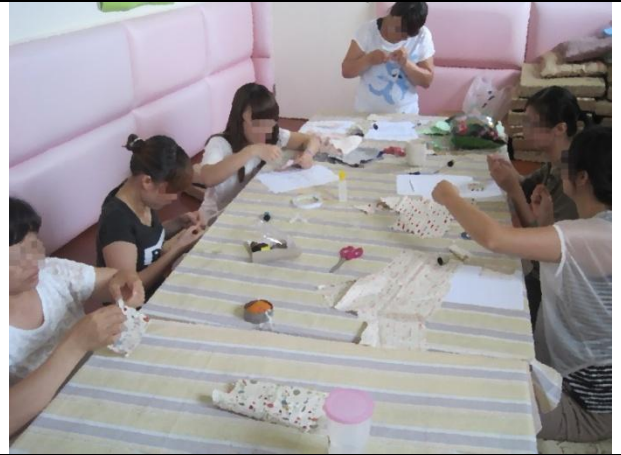
Multi-cultural class – sachet making: celebrate the Dragon Boat Festival in the traditional way.