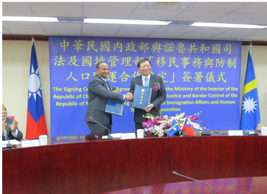
Taiwan's interior minister signed the MOU on prevention of human trafficking with the head of Immigration and Passport Section, Justice Department of Nauru.