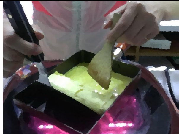
Skill training - eggroll making: invite the skilled volunteers to teach the victims what they want to learn in the hope that they could build their own businesses after returning to home countries.