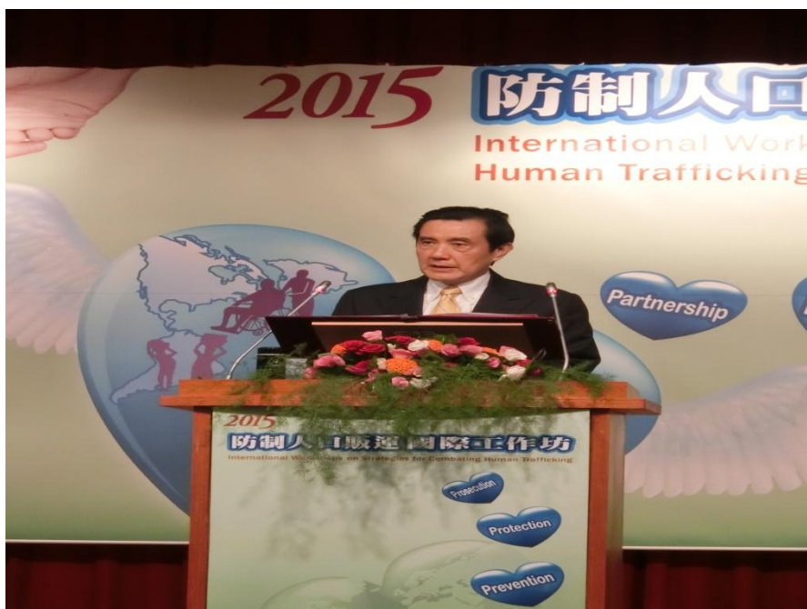
President Ma addressing at the opening ceremony