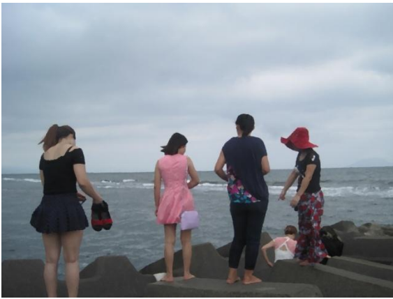
Leisure activities: the victims had fun on the beach, feeling like they were closer to their hometown on the other side of the sea.