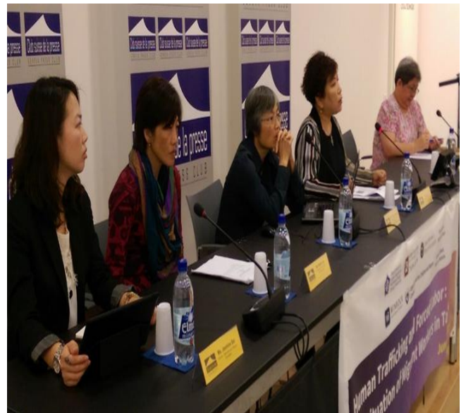
Taking part in the 104th International Labor Conference held in Geneva in June