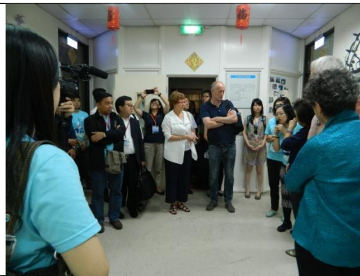
2015 International workshop on strategies on combating human trafficking: guide the workshop's delegates through the shelter and show them how victim services are carried out.