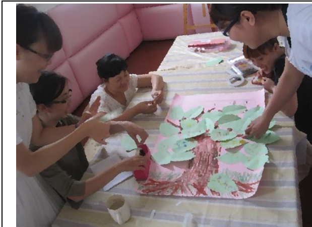
Self-growing class: the practice - tree of my merits that helps interpersonal communication and self growth.