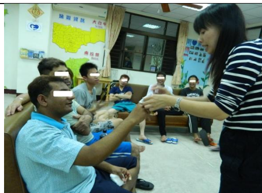
Lectures: different experts are invited to talk at the shelter according to the victims' needs, such as legal counseling and prevention of workplace hazards in the hope to help them better equipped with related knowledge and know how to protect themselves.