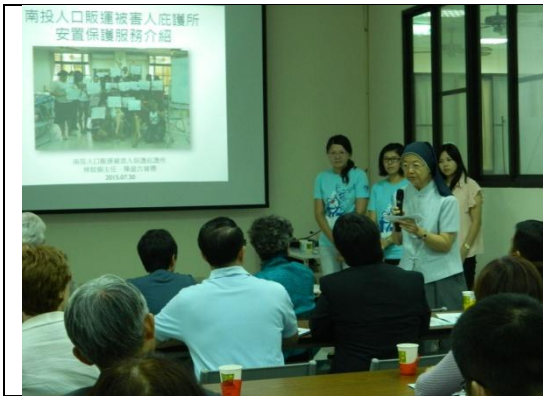
2015 International workshop on strategies on combating human trafficking: introduce victim services at the Nantou Shelter for the workshop's delegates.